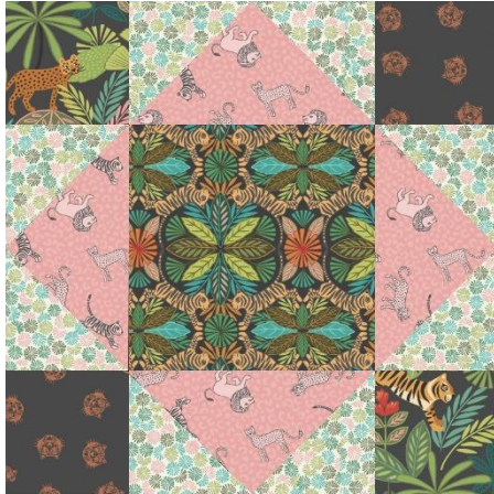
Block 1 Diagram