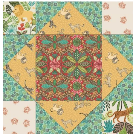
Block 2 Diagram

Lay out the fabric pieces for the blocks as in block diagram, Stitch the small triangles to the larger triangle. Sewing a triangle to one side and then the other press back. Do this to all four pieces of the block.