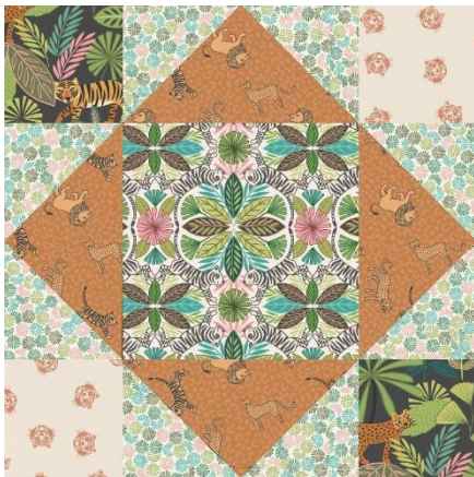
Block 1 Diagram