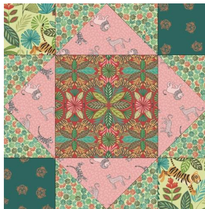
Block 2 Diagram

Lay out the fabric pieces for the blocks as in block diagram, Stitch the small triangles to the larger triangle. Sewing a triangle to one side and then the other press back. Do this to all four pieces of the block.